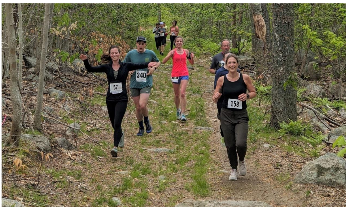
Runners mid-course during the race

And of course we are also indebted to the many volunteers (helping with parking, at registration and check-in, on the race course as supporters and safety monitors, at the finish line, and those who swiftly cleaned up all markings on the route and everything at the start-finish line immediately after the event ended), whose help and supportive presence made the event the success it was!