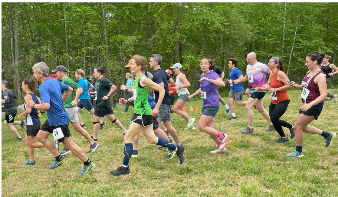
Runners at the start of the May 20, 2023 Dogtown Trail Race

The Cape Ann Trail Stewards Annual Dogtown Trail Race was held on May 20 this year and had over 100 registrants, from the North Shore area to many towns throughout Greater Boston, as well as other parts of New England (from Rhode Island to Maine), and beyond!