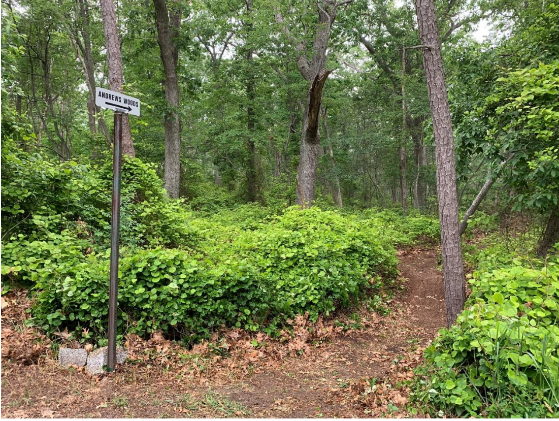
One of the entrances to Andrews Woods in Rockport, shown here after volunteers did extensive clearing of catbriar and other overgrowth during the May 2023 Trail Work Day

Group Trail Work Days are at the heart of Cape Ann Trail Stewards' mission, as we strive to involve and engage the local community in ongoing maintenance of the Cape Ann Trail networks.