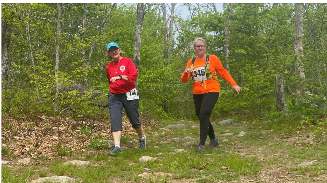
Walkers enjoying participating in this year's Dogtown Trail Race

Despite the fact that the course is highly "technical" overall, with widely varied terrain (including plenty of boulders, roots, and rolling hills!), spirits were high, and everyone seemed happy to embrace the challenge of a true "trail" experience!