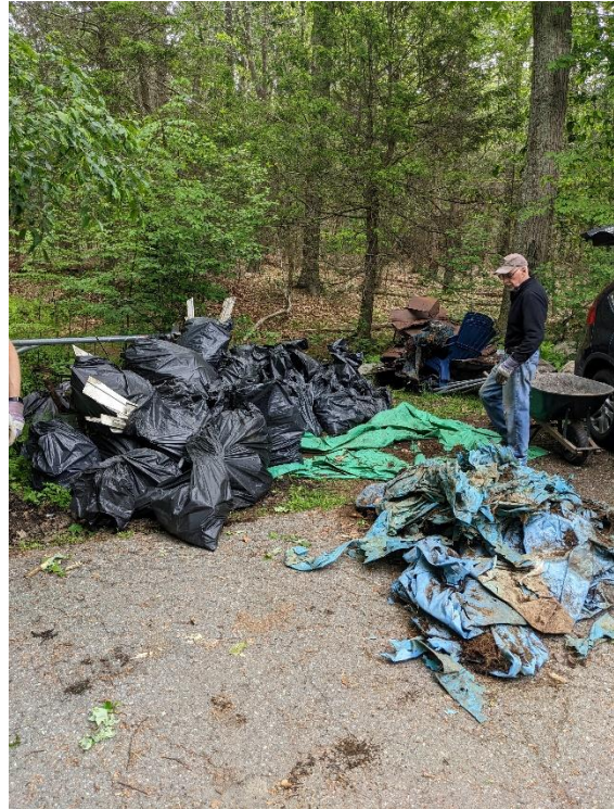
(second photo) Large trash pile that was collected on the MECT/ Manchester/ CATS trail work day, which was later removed by the Manchester DPW.

Cape Ann Trail Stewards helps to maintain existing trails, improve access, and support the responsible and safe use of the Cape Ann Trail network and recreational areas. Our work area includes: Rockport, Gloucester, Manchester and Essex.